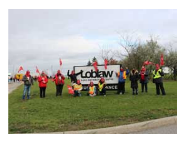
Unifor members took action in three cities against Loblaw Co. in support of striking Dominion workers with secondary pickets at distribution centres in Moncton, NB and Ajax, ON.